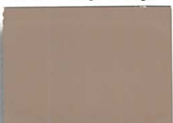
Cool Sierra Tan SRI: 57 • 24ga & 22ga