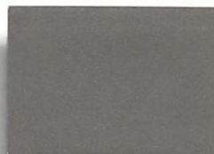
Cool Metallic Champagne SRI: 53 • 24ga & 22ga