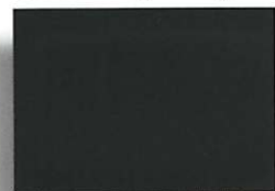
Cool Forest Green SRI: 29 • 24ga & 22ga