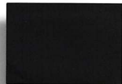
Cool Matte Black SRI: 30 • 24ga & 22ga