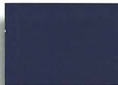
Cool Regal Blue SRI: 30 • 24ga & 22ga