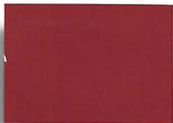
Cool Terra-Cotta SRI: 41 • 24ga & 22ga