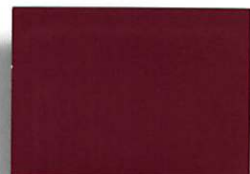
Cool Colonial Red SRI: 35 • 24ga & 22ga