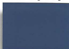
Cool Tahoe Blue SRI: 30 • 24ga & 22ga