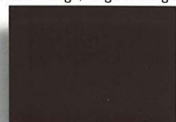
Cool Dark Bronze SRI: 36 • 24ga & 22ga