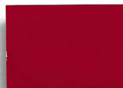
Cool Red SRI: 49 • 24ga & 22ga