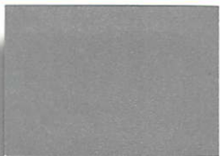
Cool Metallic Silver SRI: 59 • 24ga & 22ga