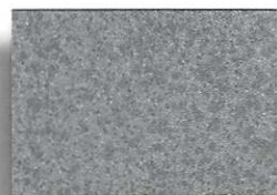
Zinalume® Plus (unpainted) SRI: 32 • 24ga, 22ga & 20 ga