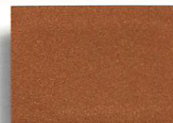
Cool Metallic Copper SRI: 58 • 24ga & 22ga