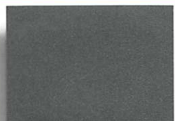
Cool ZACtique® II SRI: 36 • 24ga & 22ga