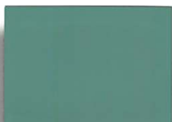
Cool Marine Green SRI: 45 • 24ga & 22ga