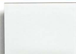
Cool Regal White SRI: 85 • 24ga & 22ga